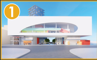
1 Riverside Downtown Library