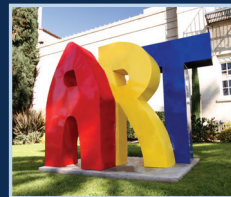
Riverside Art Museum