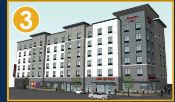
3 Hampton Inn

Riverside Food Lab will be a culinary showcase bringing together multiple independent eateries that specialize in locally-grown, artisanal, organic, and handcrafted foods and beverages.