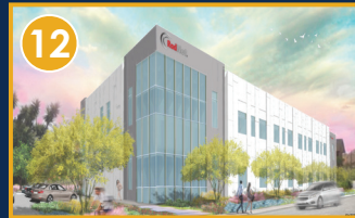
12 Radnet Medical Building