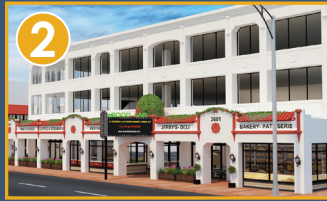
2 Riverside Food Lab

Riverside Food Lab will be a culinary showcase bringing together multiple independent eateries that specialize in locally-grown, artisanal, organic, and handcrafted foods and beverages.