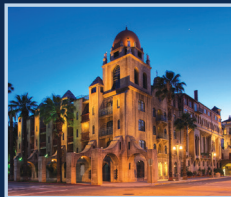
The Mission Inn Hotel & Spa