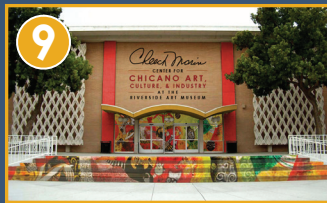
9 Cheech Marin Center

The Cheech Marin Center for Chicano Art, Culture and Industry will be a permanent home for more than 700 works of Chicano art, including paintings, sculptures, and photography, making up the most renowned collection in the United States.