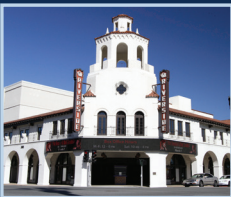
Fox Performing Arts Center