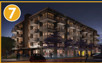
7 Main and 9th