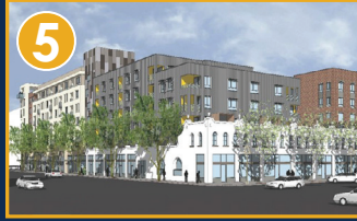
5 Stalder Building