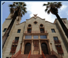
Riverside Municipal Auditorium