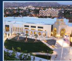
Riverside Convention Center