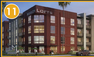
11 Mission Lofts