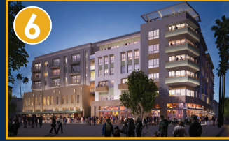
6 Imperial Lofts