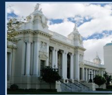
Riverside County Courthouse