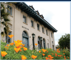
Riverside Metropolitan Museum