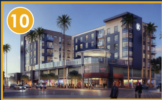
10 Hilton Riverside

Chow Alley will be a walkable outdoor and active urban dining venue to include multiple foods and commercial vendors, which could blend individual retired and refurbished shipping containers, carts and quasi-permanent micro-kitchens with ample shared seating areas.